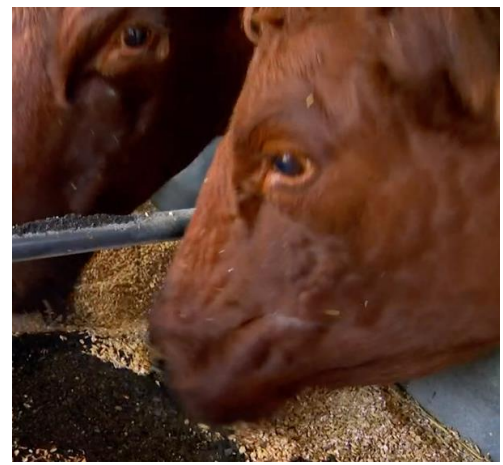
Biochar added to cattle feed

https://static.wixstatic.com/media/cc21d6_552e7217fac5401993f92b2a67a6e386~mv2_ d_2238_1258_s_2.jpg/v1/fill/w_1000,h_562,al_c,q_90,usm_0.66_1.00_0.01/cc21d6_552 e7217fac5401993f92b2a67a6e386~mv2_d_2238_1258_s_2.jpg