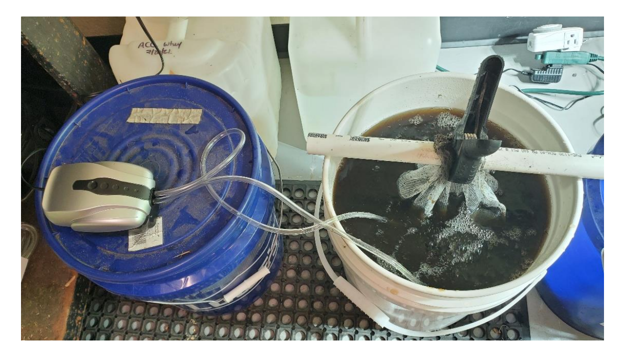
Brewing aerobic compost tea: the aquarium pump on the left provides aeration while compost is suspended in a paint strainer bag in the solution

Anaerobic digester effluent provides another quick means of biochar charging. An anaerobic digester is essentially a big stomach. It is primed with manure and uses similar a similar bacterial community to the stomach of a cow to digest food waste. It produces methane, which can be used to cook, as well as effluent, which is like a liquid form of compost. It is more nutrient dense than compost tea and provides a reasonable alternative to a compost pile. Charging biochar with effluent is simple. The two are mixed and allowed to sit for about 72 hours, after which they can be applied to soil.