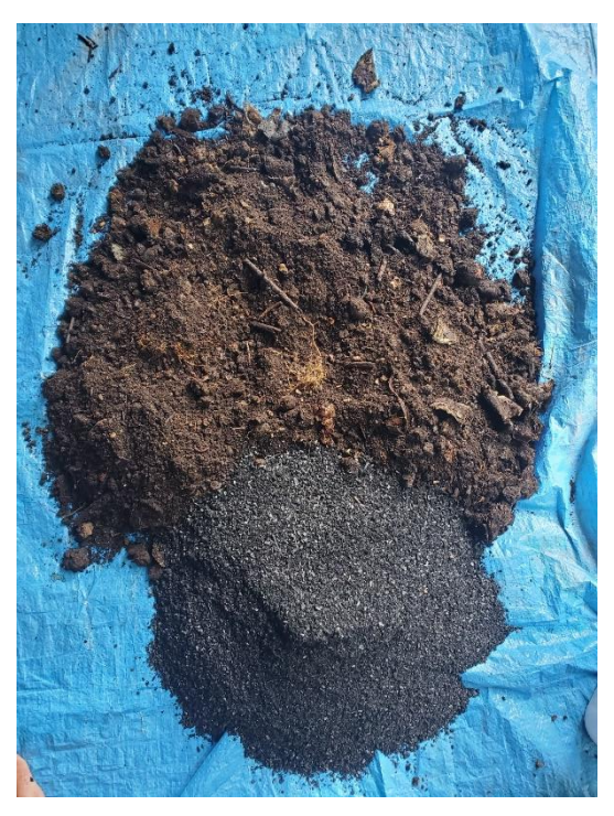
Biochar and mature compost before mixing

For many of the same reasons biochar is so beneficial in soil, biochar can be greatly beneficial to the composting process. Co-composting involves mixing biochar with compost at the beginning of the composting process. This results in higher composting temperatures, which leads to faster composting. It also