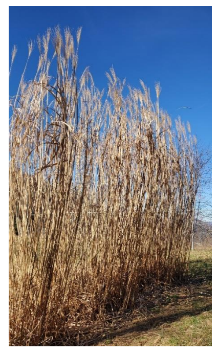
Miscanthus, a common energy crop and biochar feedstock

Manure and bone can make more nutrient-dense chars and can often be sourced for low-cost or free.