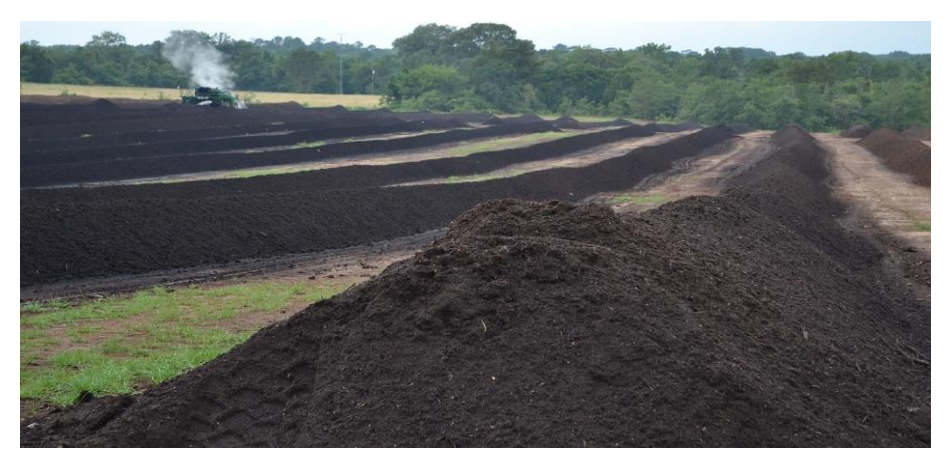
Biochar co-composted in windrows