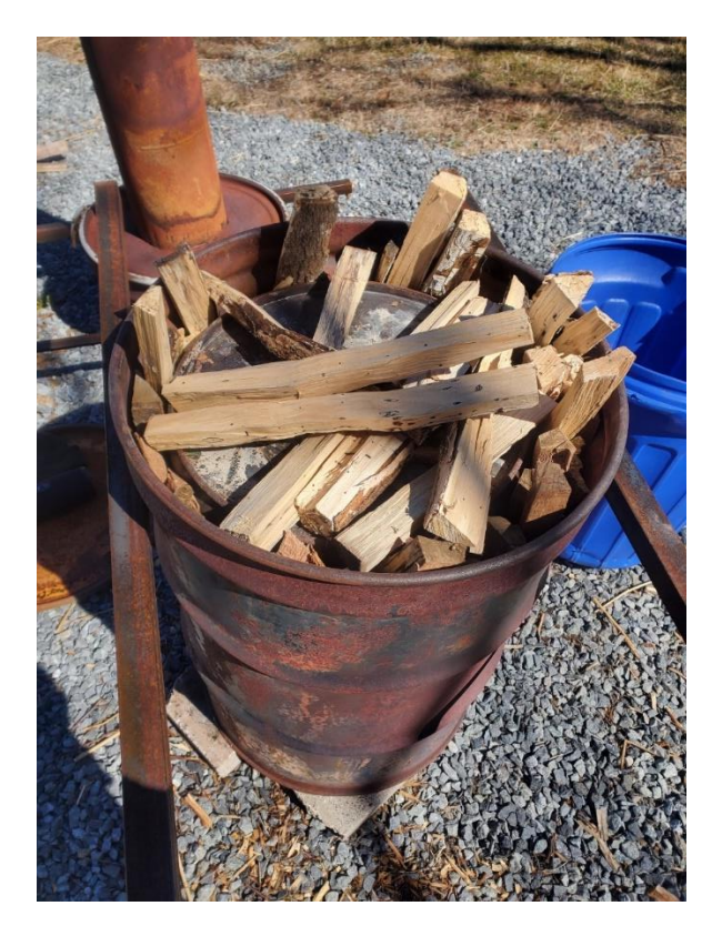
TLUD with top removed to show retort inside