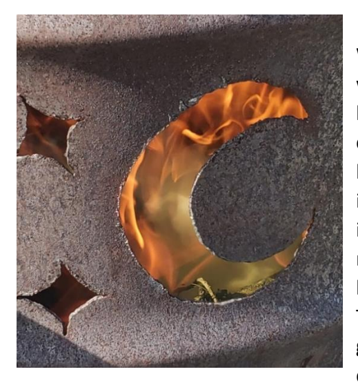
Yellow smoke within the TLUD indicates methane and other harmful gases

To achieve full combustion, high heat and plenty oxygen is needed. Contrary to what you might think, a large fire burning dry feedstock produces limited emissions because the area above the kiln has a high amount of heat and plenty of oxygen for full combustion. In the TLUD, air is pulled into the top drum, mixing with high heat to fully burn any harmful gases.