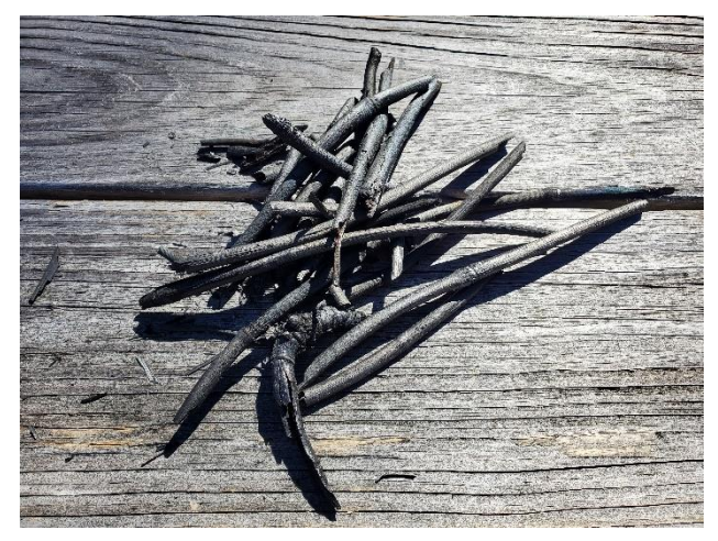
Biochar made from Miscanthus grass

Biochar is generally characterized as a soil amendment, but has been used for hundreds of things, such as for water filtration,