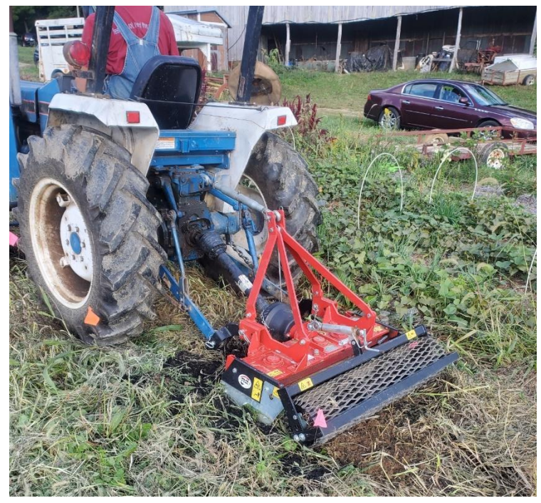
A power harrow incorporates biochar into soil

Biochar application rates can vary significantly depending on availability, budget, and soil needs. Rates between 1/2 and 20+ cubic yards/acre are common. A general goal of 5-10 cubic yards/acre is a good goal, although this depends on soil needs and results and shouldn't necessarily be applied all at once. The table below shows common application rates.