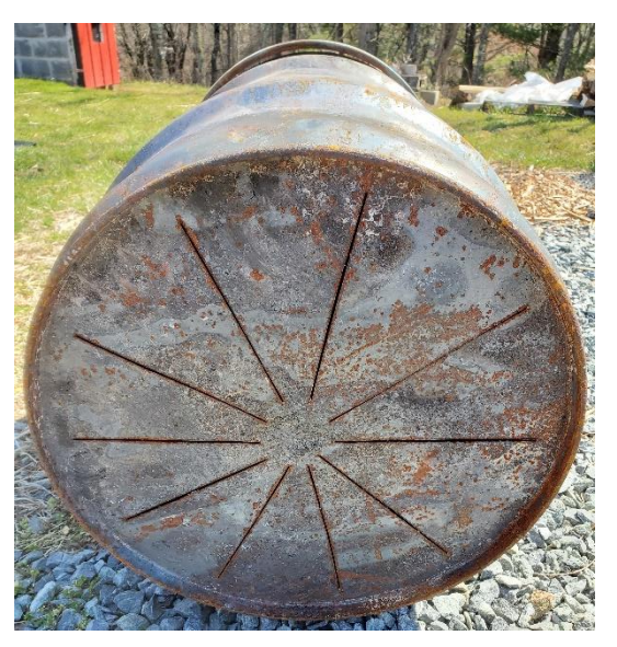
Slits cut in the bottom of the retort allow gas to escape, preventing explosion

A slightly more complex biochar kiln involves the use of a retort . A retort is an enclosed chamber which holds the feedstock and is externally heated. Unlike in the TLUD or the open pit kiln, the feedstock is not burned. As it is heated, it undergoes pyrolysis, decomposing and releasing volatile compounds. These gases are vented, often directly into the source of heat where they burn and contribute to the heat needed for pyrolysis. Meanwhile, the remaining solids are converted into a more persistent form – biochar!