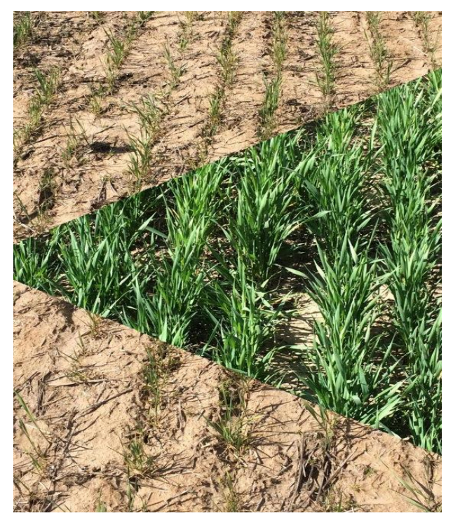
Effects of biochar on wheat

Biochar is highly porous. This allows it to hold lots of water – easily up to 6 times its weight! This means it can keep soil from drying out,