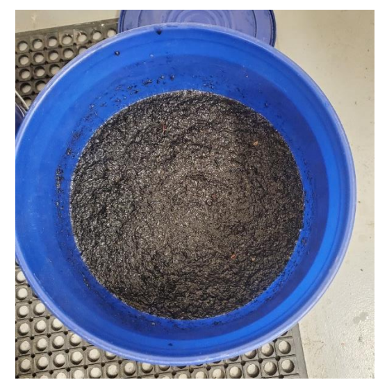
Biochar charging in anaerobic digester effluent

Anaerobic digester effluent provides another quick means of biochar charging. An anaerobic digester is essentially a big stomach. It is primed with manure and uses similar a similar bacterial community to the stomach of a cow to digest food waste. It produces methane, which can be used to cook, as well as effluent, which is like a liquid form of compost. It is more nutrient dense than compost tea and provides a reasonable alternative to a compost pile. Charging biochar with effluent is simple. The two are mixed and allowed to sit for about 72 hours, after which they can be applied to soil.