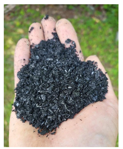
A handful of crushed pine biochar

Dry biochar crushes easiest, but this can cause it to make a lot of dust. Be careful of dust! Biochar doesn't decompose, so it'll stick around in your lungs like coal dust, which is less than desirable. Wear a respirator if you're exposed to biochar dust.