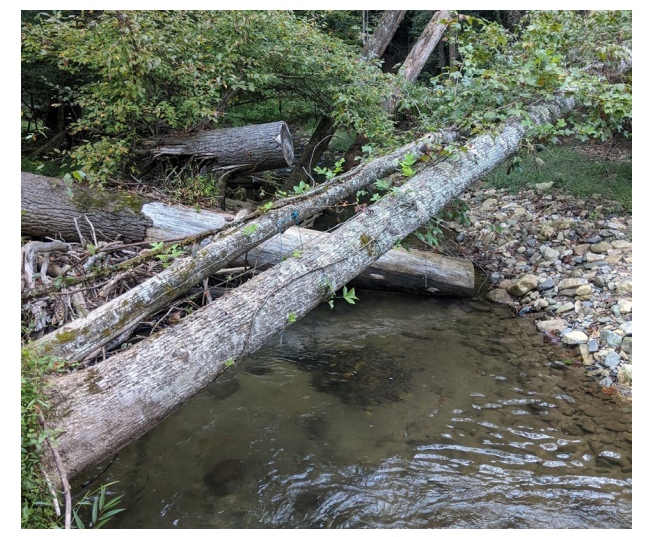
Removing Stream Debris