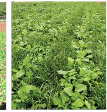
Plant Cover Crops