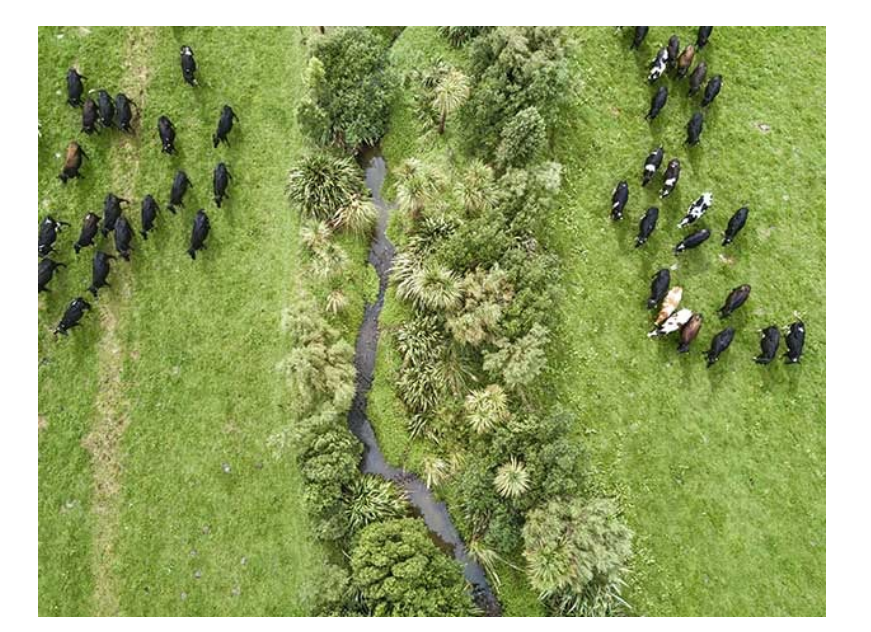
Plant Native Vegetation in Riparian Areas