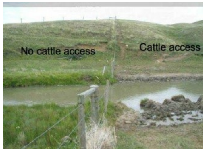
Exclude Livestock From Surface Waters